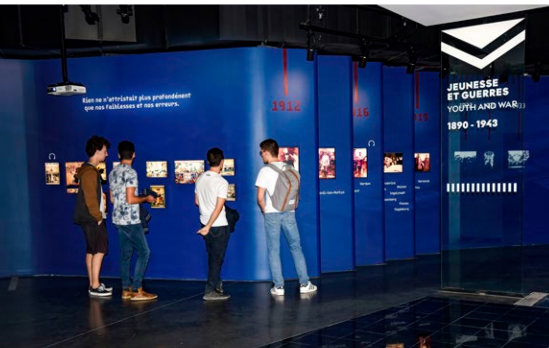
North façade of the Hôtel National des Invalides Historial Charles de Gaulle Inspecting an archival collection