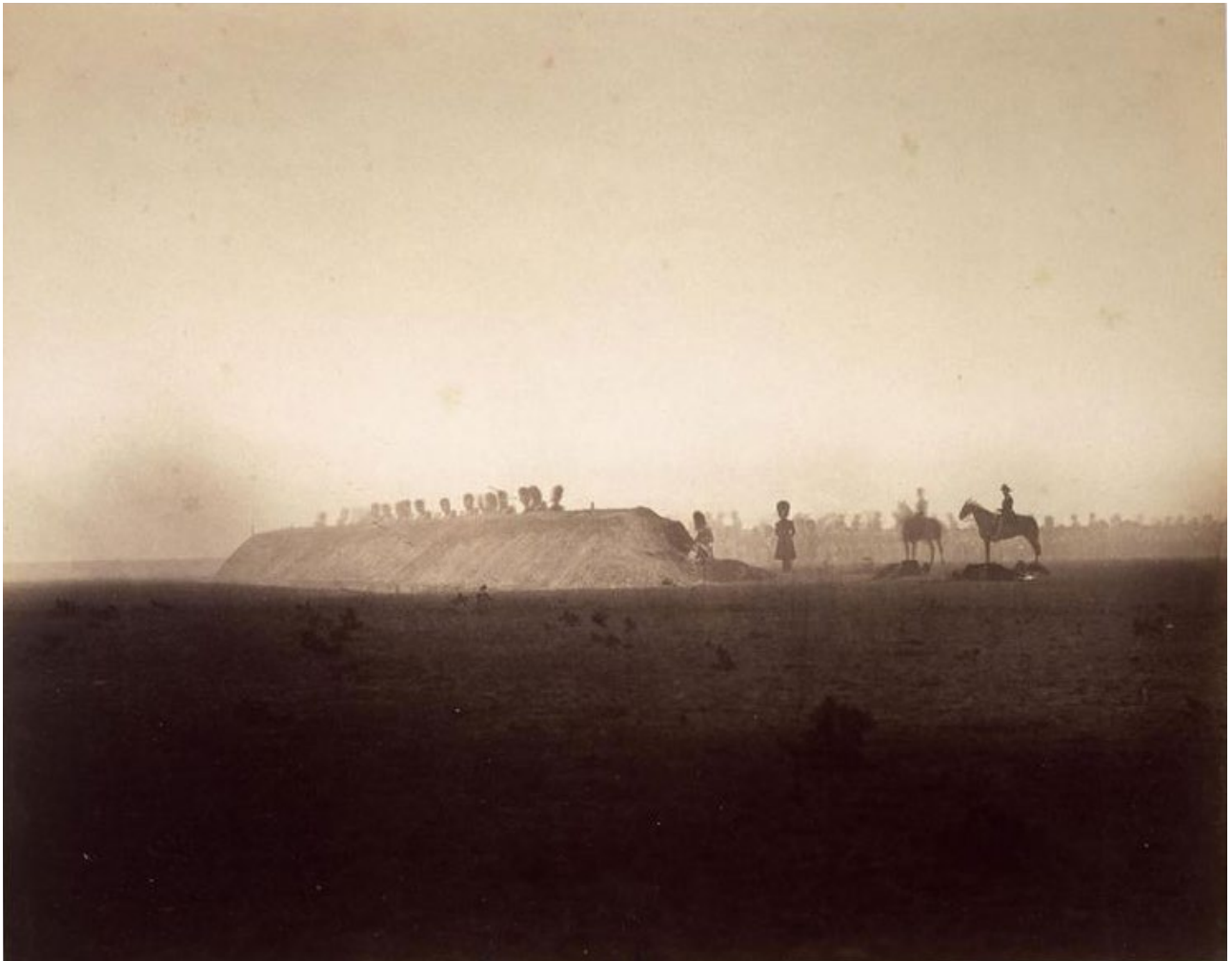
Gustave Le Gray, Camp in Châlons: manoeuvres on 3 October 1857 Monochrome on albumen paper, (1865 - Lepic album), 29.3 x 36.9 cm, musée de l'Armée, inv.9512.1.17