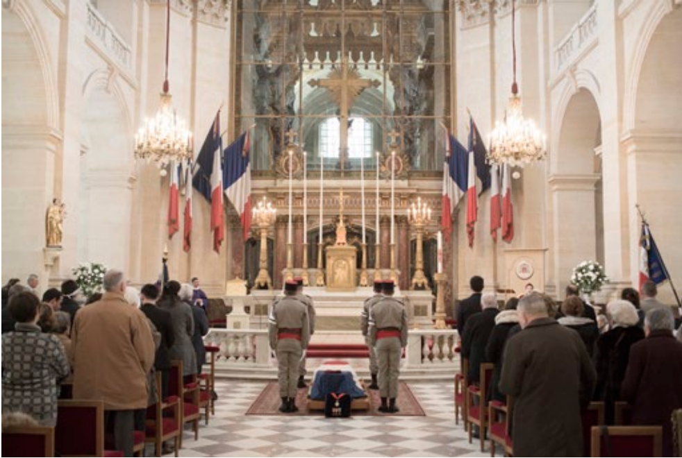
Philippe de Poulpique Invalides. Mémoires de guerre. Last respects paid to a Les Invalides resident at Saint- Louis des Invalides Cathedral, Paris, 2017. Silver print on baryta paper, 40 x 50 cm, Musée de l'Armée, inv. 2018.51

Projection of the future Reception desk/tickets MINERVE