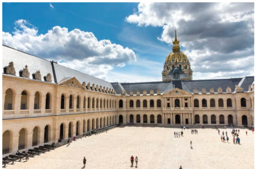
Les Invalides, Main Courtyard

A “Musée de France” under the aegis of the Ministry of the Armed Forces, the Musée de l'Armée is a museum of history, science and technology, fine arts and society all in one. Housing almost 500,000 items relating to military life and war, from prehistory to the 21st century, it is one of the world's most extensive collections in its field and includes many prestigious pieces that once belonged to royal collections. Photography holds a special place among the uniforms, weapons, drawings, paintings and everyday objects it contains, with a collection of almost 80,000 images, all materials and processes combined, covering the medium's entire historical field from 1845 to the present day.